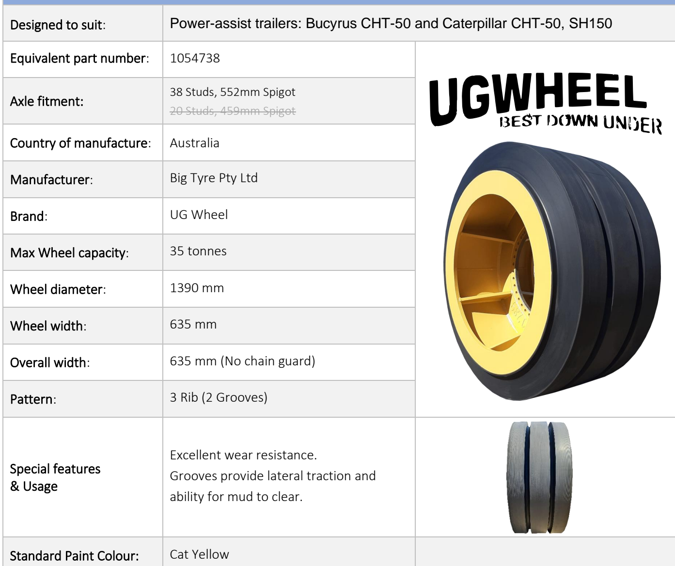
SH150: Max Speed vs Load for use on CHT50 & SH150